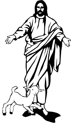
The Good Shepherd